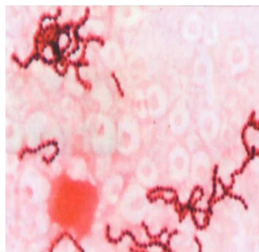
Fig#4. Gram-stained smear from a pure culture of streptococcus