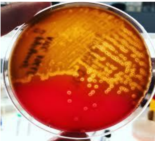
Fig#1 Growth of a culture of staphylococcus on blood agar

At the same time, Gram-positive flora prevailed in terms of abundance and species composition in the biocenosis, which was colonized in 100% of the subjects. It is interesting to note that the main part of the microflora of the oral cavity in the control group consisted of representatives of the genus Streptococcus , among which the dominant strains were Streptococcus salivarius . These data are in good agreement with the literature data.