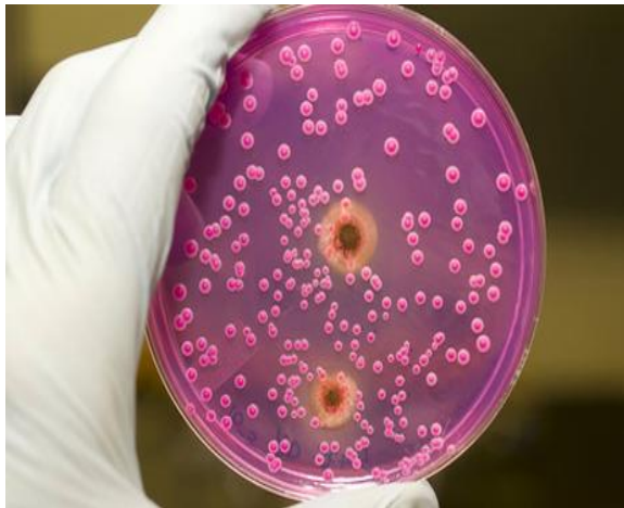
Fig #5. Growth of fungal culture on Sabouraud's medium