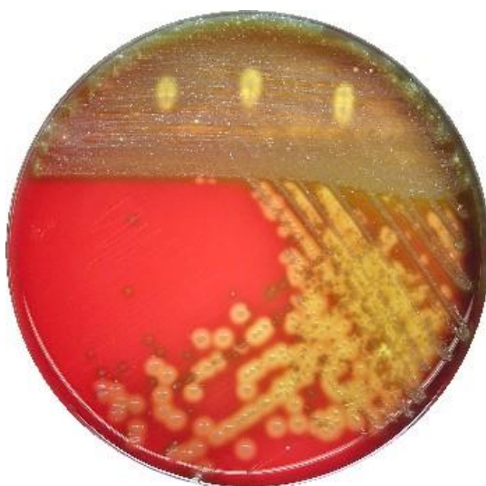
Fig#3. Streptococcus culture growth on blood agar